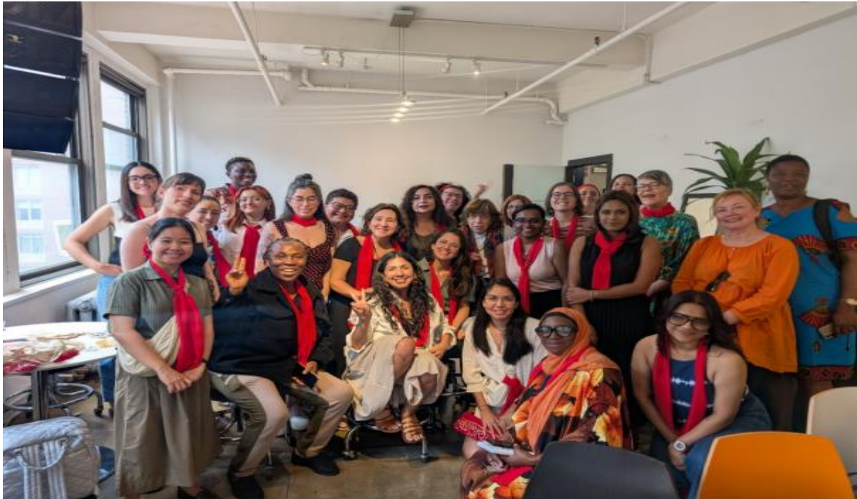
Women Major Group Orientation on Sunday 13 th July 2025 at 12 noon