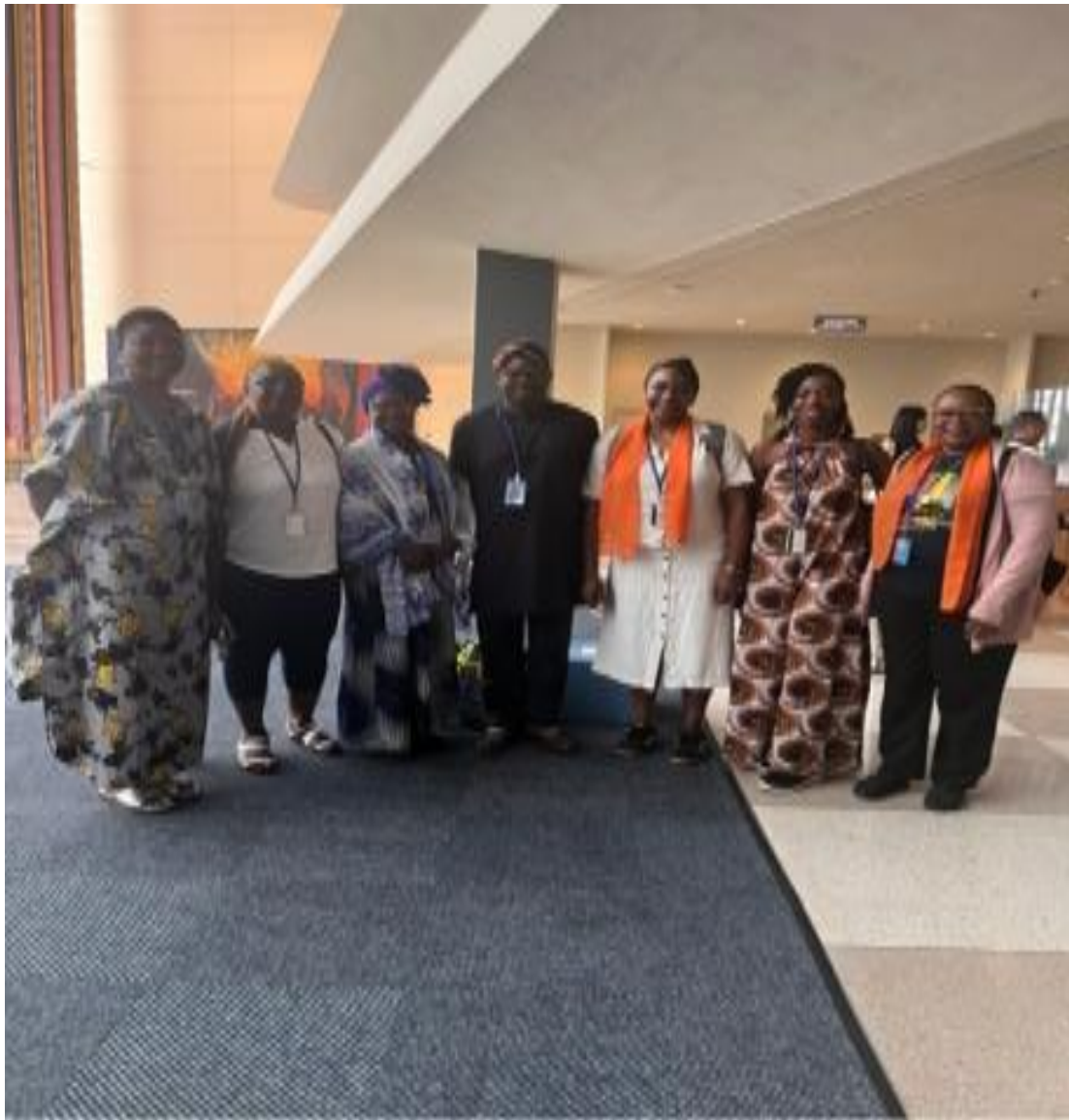
Nigerian NGOs at UN Headquarters lobby after Nigerian VNR Statement