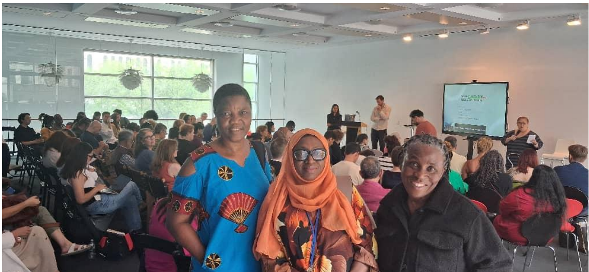
Major Group and Others Stakeholders Orientation Sunday 13th July 2025 from 2-5pm at the Scandinavian House