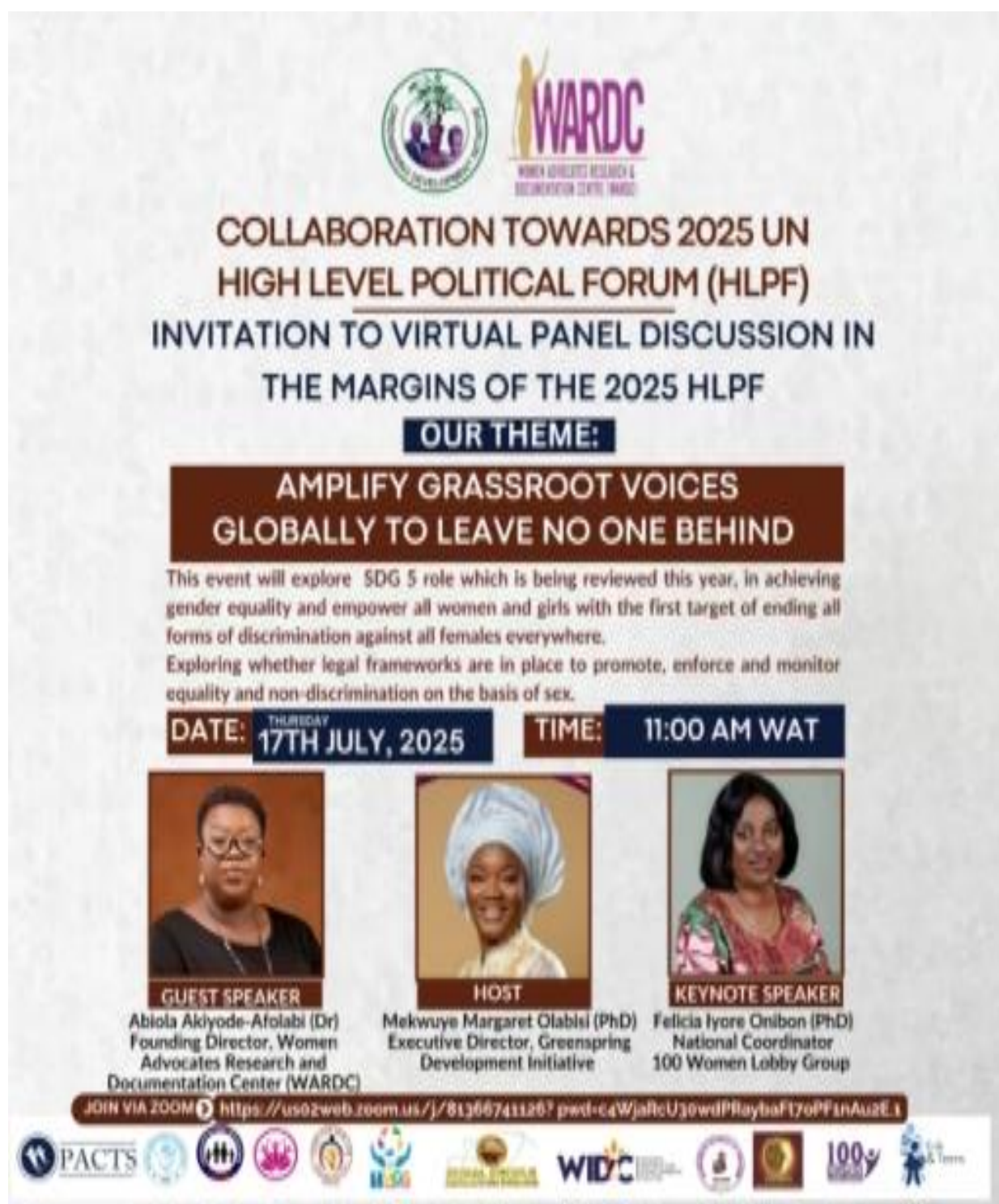
Flyer produced for sensitisation towards Goal 5 webinar

PICTURES DEPICTING NIGERIAN TEAMS AND INTERVENTIONS