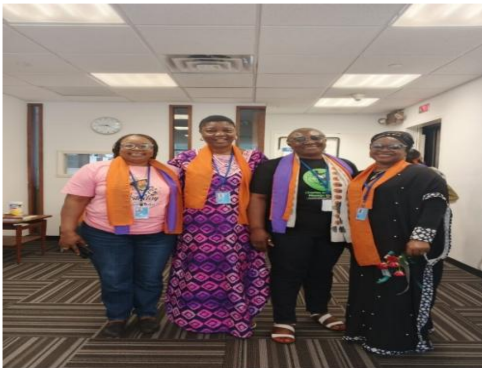
WEP, Greenspring Development Initiative and KAZUL at WMG caucus meeting