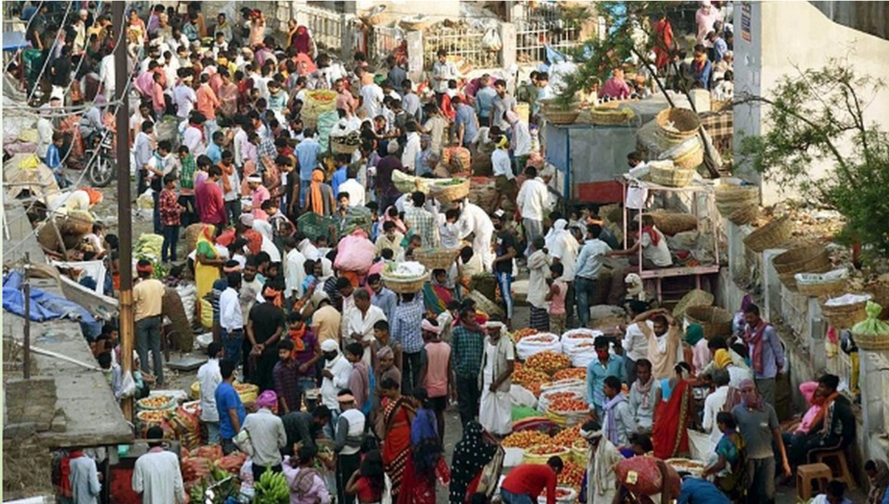
Physical distancing... In India?