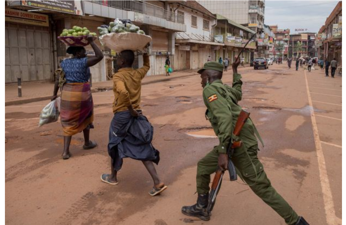
Working from home... In Africa?